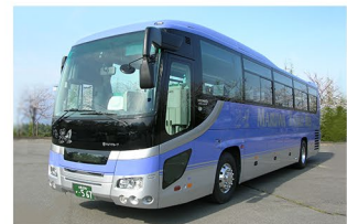
Free shuttle bus

After exiting the station by the stairs/lift, turn left. Buses depart from the furthest bus stop ahead, on scheduled timings.